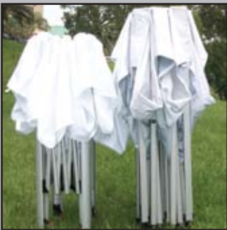
EX-DOME TRADITIONAL GAZEBO